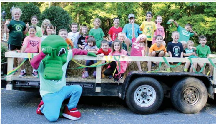
Glen Allen Day Parade – The children enjoyed!

A contest will be held to choose the art work featured on the cover of the directory. Please have your child submit a picture on 8.5 x 11 paper with the 'Gator Grooves', Greenwood Elementary, & 2017-2018 on it. Entries for the contest can be submitted in the daily communications folders by 10/6/2017. The winner will be chosen by a panel of judges. Please have your student include their name, grade and teacher's name on the back of the paper.